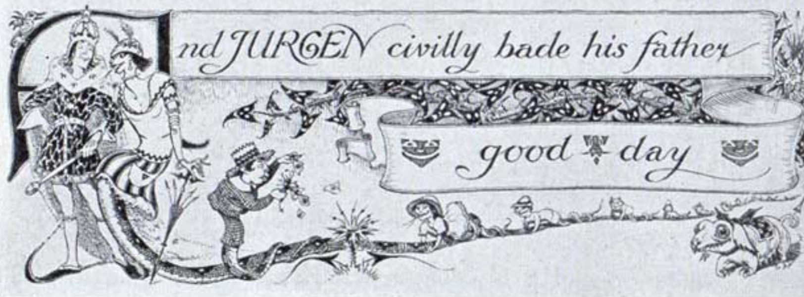
JURGEN'S PROGRESS TO HELL