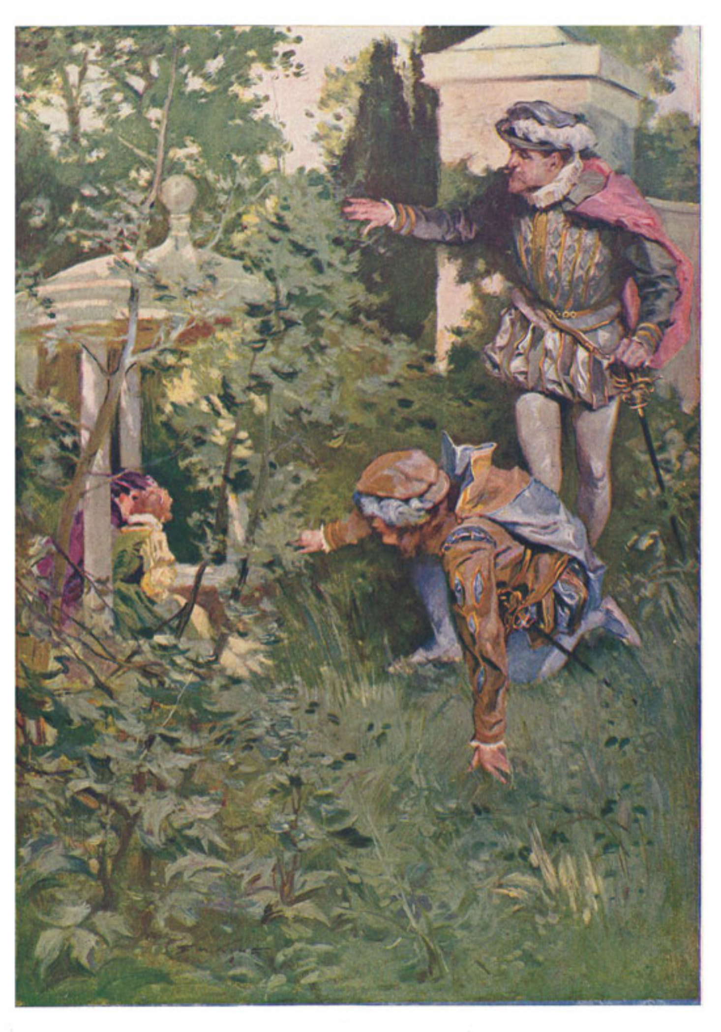
THEY WENT WESTWARD TOWARD THE SUMMER PAVILION