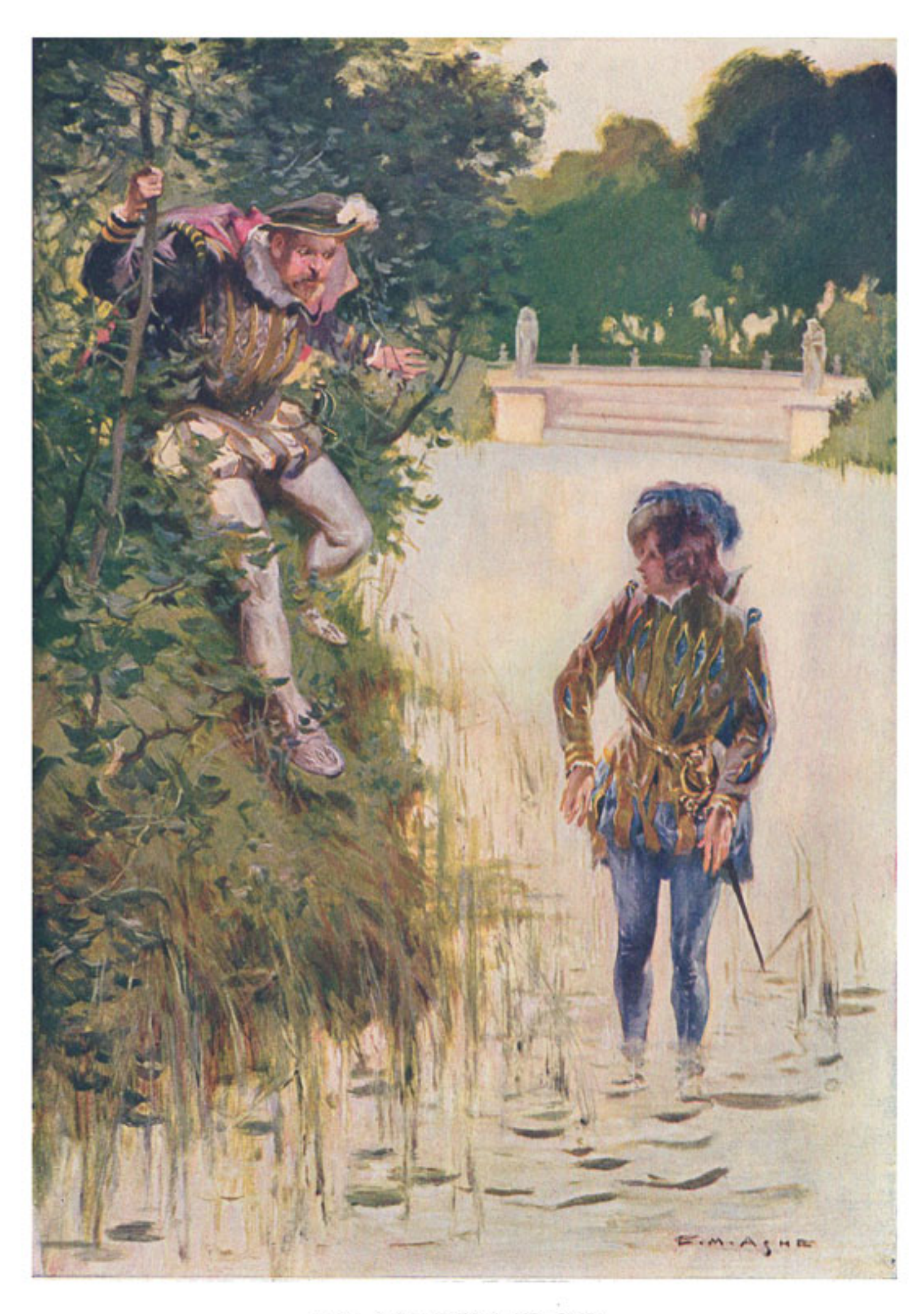
"OH, KATE, KATE!" HE CRIED